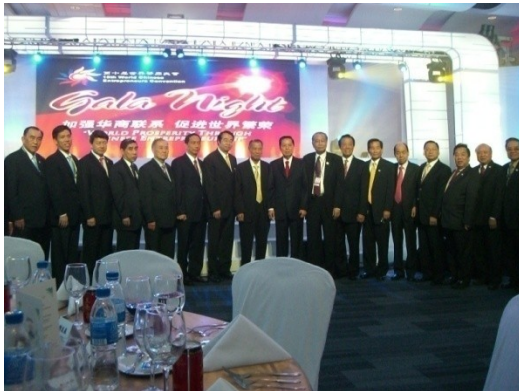
一堂に会した華商財閥オーナー 及び 会議ホスト国の幹部