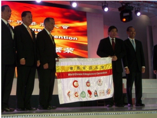
華商財閥 Dr. Lucio Tan 及び他財閥オーナー シンガポール政府外相 Mr. George Yeo – Minister for Foreign Affairs, Republic of Singapore