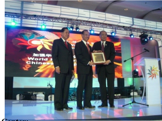
Center: Mr. George Yeo – Minister for Foreign Affairs, Ministry of Foreign Affairs, Singapore シンガポール政府外相