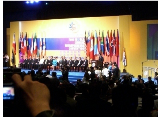
世界20カ国の華商代表、 中国政府代表・幹部、ホスト国Arroyoフィリピン大統領 含む